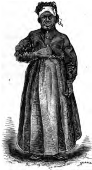
LUBRA IN FULL COSTUME.

ing character, he offered me something to drink, which he had in a bottle ; I refused. He then attempted to dismount, when I drew my pistol, telling him if he made another move to get off his horse I should fire ; forgetting for the moment that he, too, might be armed. But, however, after a deal of abuse he